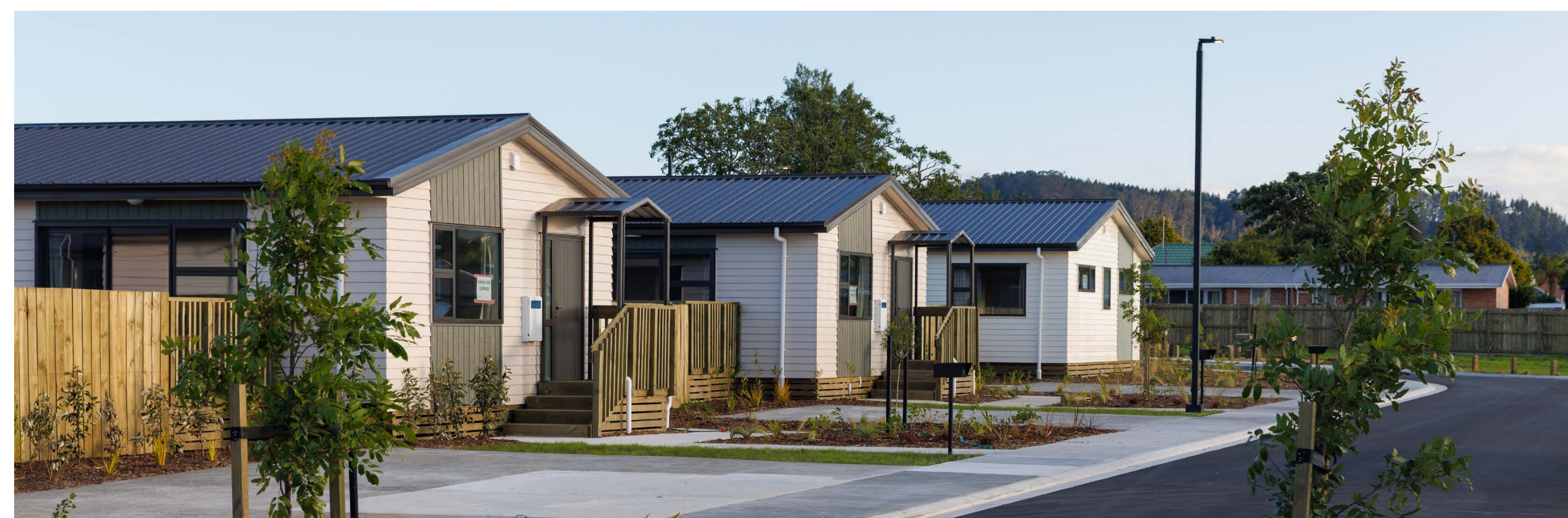
New homes at Ranolf Street / Malfroy Road