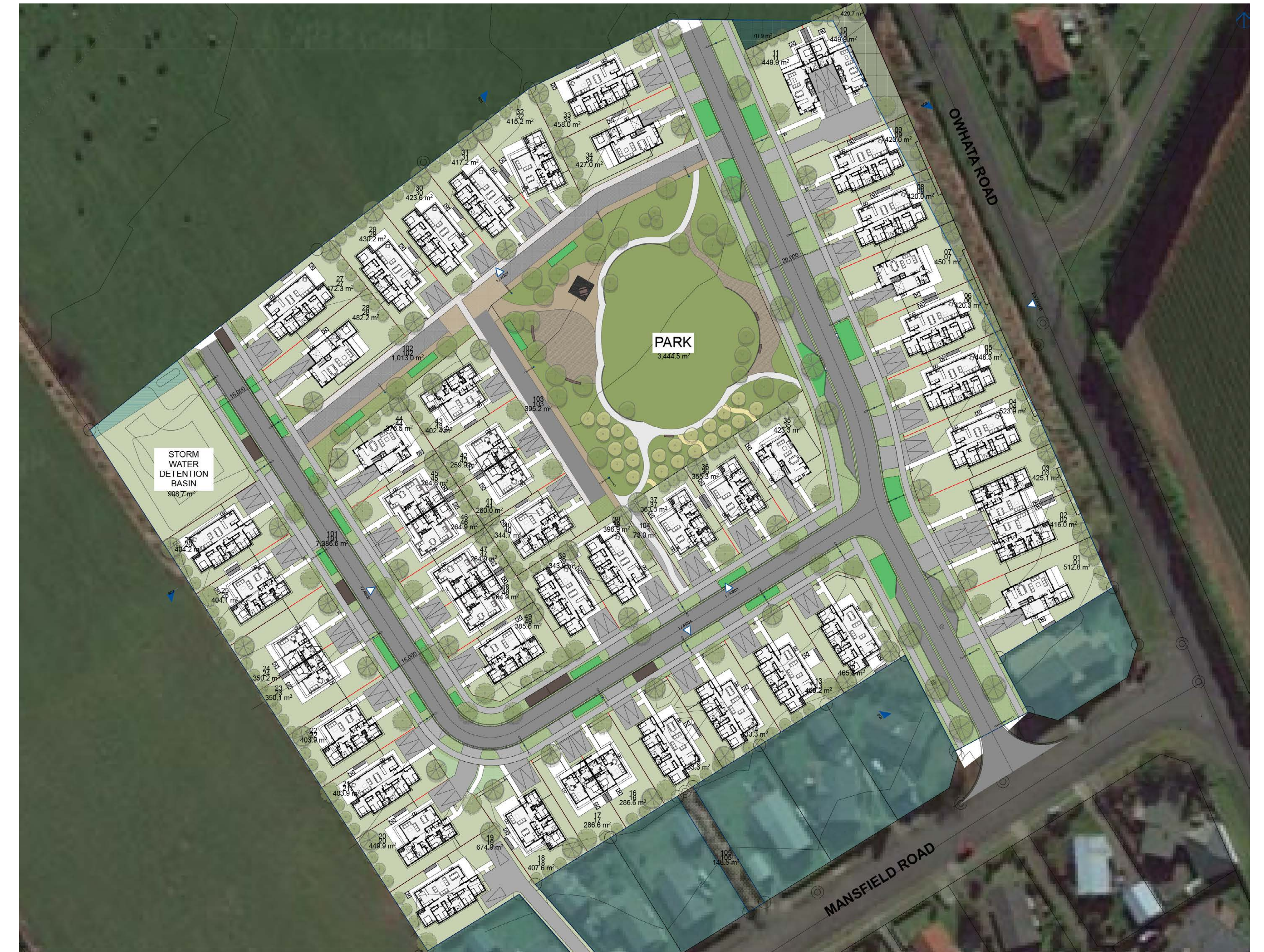
Site plan, showing park, roading and landscaping