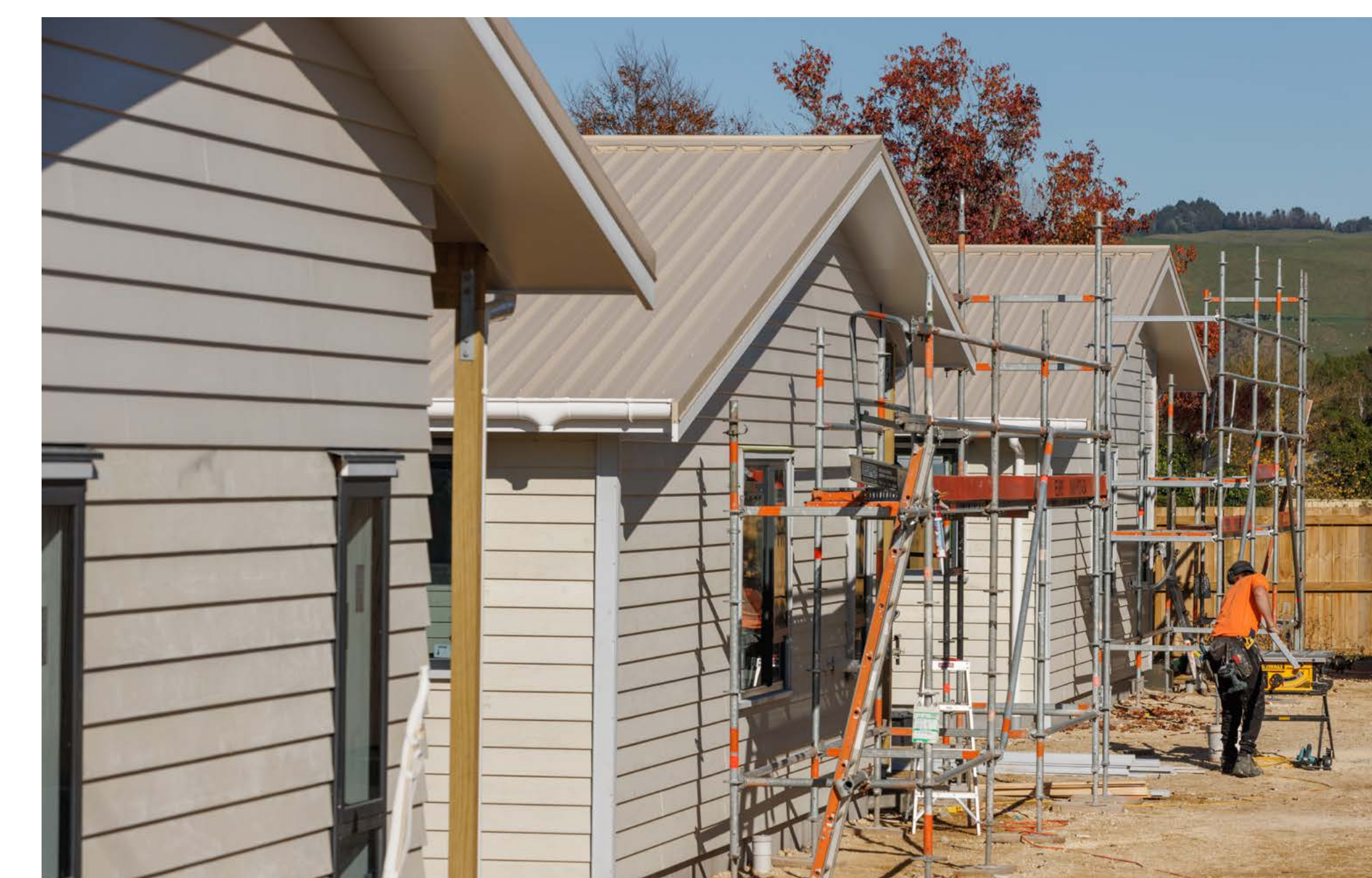
Under construction homes in Rotorua