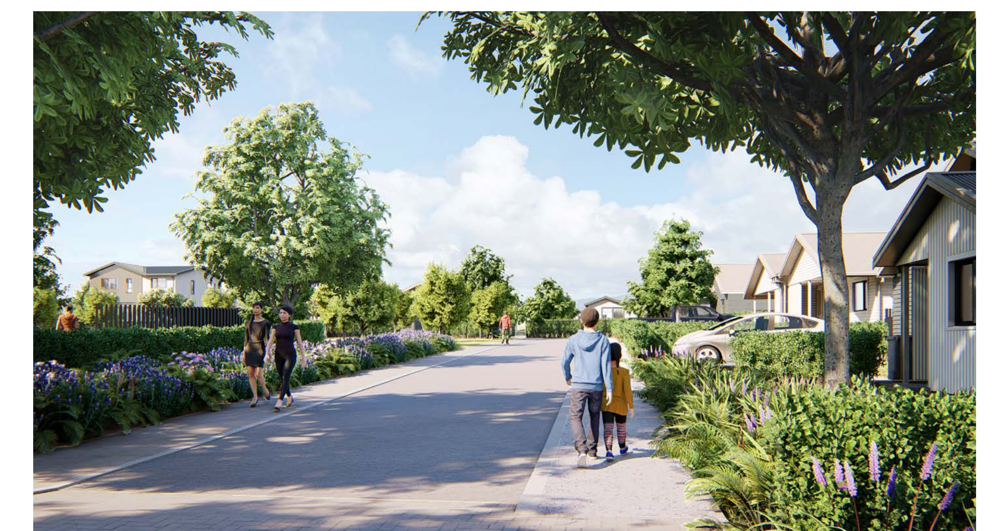
View of completed homes, opposite park