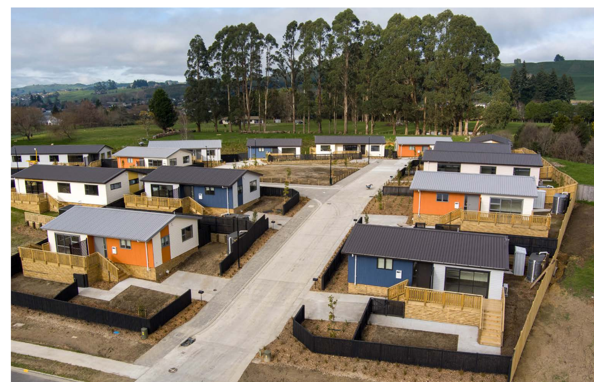
Completed homes at Quartz Avenue

The Accord works to ensure everyone in Rotorua has a place to call home through increasing housing supply; and that those needing emergency housing can be transitioned, with care, to appropriate accommodation where they're able to maintain independent living.