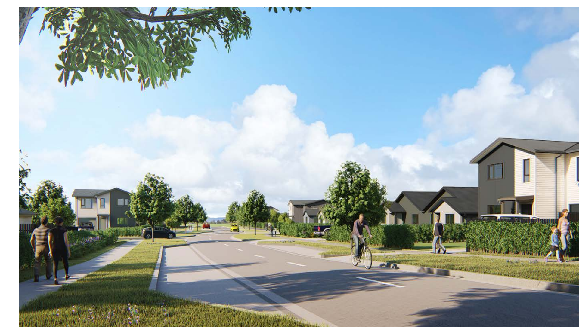
Completed homes, looking north from Mansfield Road entrance